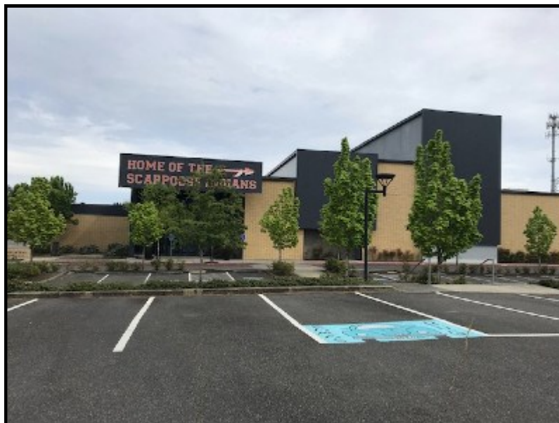
Scappoose High School, Scappoose, Oregon