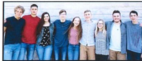
IYC HIGH SCHOOL BAND