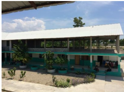
St. Ard Hospital with its unfinished second story.

is good news coming out of the community of St. Ard. The Church of God hospital, which has seen more than 100,000 different patients since it opened its doors in July 2005, is setting its sights on expanding. God has given the ministry, which is currently open five days a week, the exciting vision to become a 24-7 hospital and further promote physical and spiritual healing in Haiti.