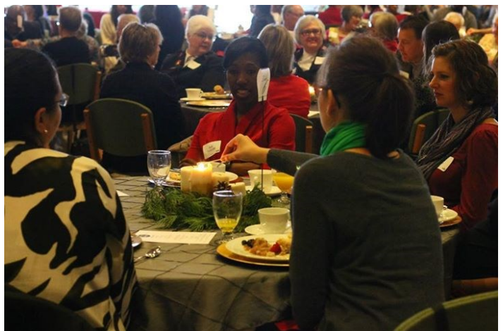
Third Annual WPC Advent Brunch

Photos can be found at: http://tinyurl.com/WPCAdvent