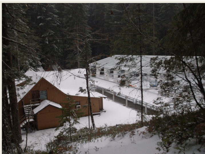
Multipurpose Building work will resume in the Spring.