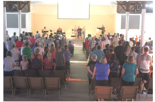
Worshipping the Lord