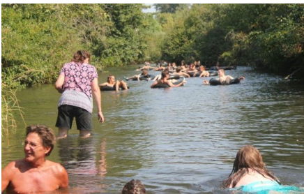
Relaxing in the creek

What started as an outgrowth of Region 3 (primarily the Albany, Salem and Woodburn churches), this year's meeting expanded to include the entire district. The "Summer Impact" youth joined forces and had a great first-year in a new location and added a mission project, putting together packages for "Every Child," a faith-based movement that is aiding foster families.