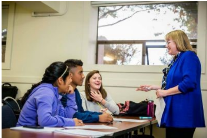
Warner Pacific is committed to diversity.

Established as Pacific Bible College in 1937 by the Church of God (Anderson, Indiana) in Spokane, Washington, this is not the first major identity change for the institution. The school moved to Portland in 1940 and became Warner Pacific College in 1959. For nearly a decade, Warner Pacific has been recognized for a commitment to diversity in higher education, with 63 percent of students coming from racially and ethnically diverse backgrounds.