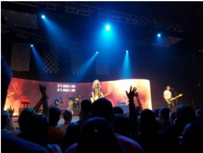
Zealand leading students in worship at IYC2018.

by Carl Stagner, Church of God Ministries