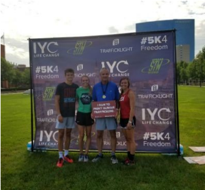
Runners pause to celebrate their completion of the 5K For Freedom!

Can you picture thousands of students walking through downtown Indianapolis without saying a word? It's hard enough to imagine even one teenager staying silent for long. But that was the scene the final evening of IYC during the Silent Walk, which brought students out of the Indianapolis Convention Center and onto the streets, culminating in Communion at nearby Military Park. Like 1980, IYC made its mark on Indianapolis, but the city does look quite different than it did then.