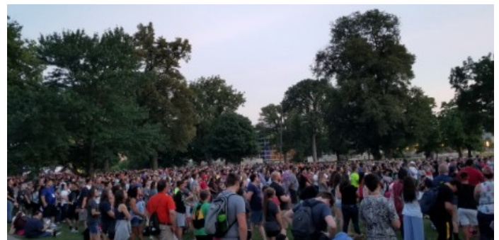
Students gathered for Communion following the Silent Walk

What would motivate three hundred students to forego sleeping in and instead embark on a five-kilometer race on a sun-scorched, sweltering summer morning in Indianapolis? The 5K was a first for IYC, yet every slot was filled in advance. All enjoyed the camaraderie, some were competitive, but no one was in it for a trophy. There had to be a purpose greater than themselves, and there certainly was. Proceeds from the 5K For Freedom went to support the life-giving fight against human trafficking through CHOG Trafficklight, particularly in one Bangladesh village. Students also gave generously during IYC to Spread the Word in support of Trafficklight.