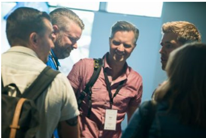
Fellowship at First Church on Tuesday was sweet