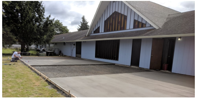
Longview Church of God adds back patio. Tira passes baton/staff to Jamieson.

Then, "Way Out West" VBS for kids entering Kindergarten through 5th grade is scheduled for Aug. 20-24, 6-8 p.m.