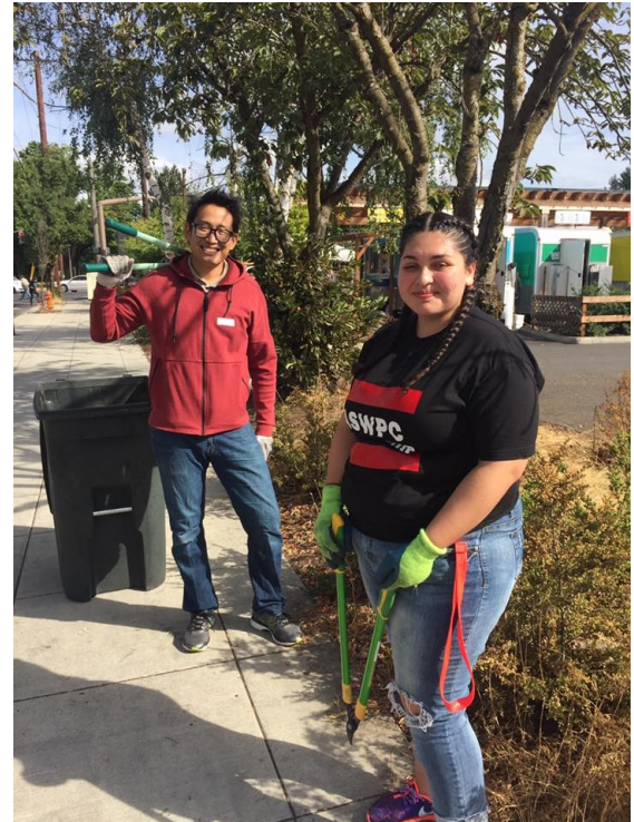
WP students participate in service projects to support community.

Remember to login and donate for our Founder's Day giving campaign! We are asking friends and alumni to