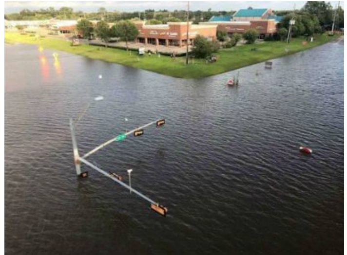
Flooding up to the street lights in Houston.

The devastation is also mind-blowing. Damage left in the wake of Hurricane Harvey is nothing short of catastrophic. Forty-two Church of God congregations have been affected by Harvey's wrath to one degree or another. Eleven congregations have reported damage of varying severity. While damage to church structures has been minimal, damage to homes of our pastors and brothers and sisters who worship in our congregations is widespread. Initial damage estimates among our congregations suggest up to a half a million dollars of repairs and rebuilding efforts will be needed. A disaster recovery plan is