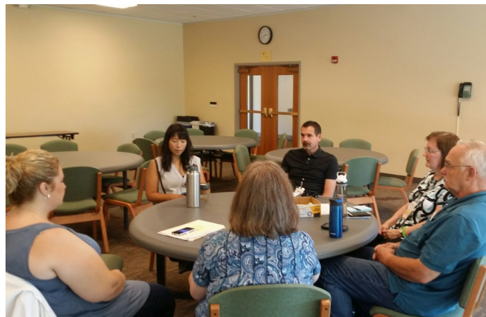
Summer IMPACT! Planning Session