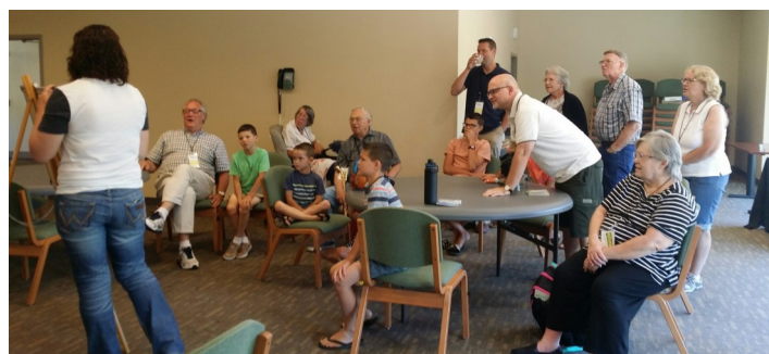
Pictionary at The Gathering Place