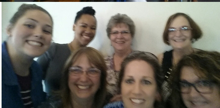
Above: Ministry Cohort Conversations Below: Child Care during Worship Service