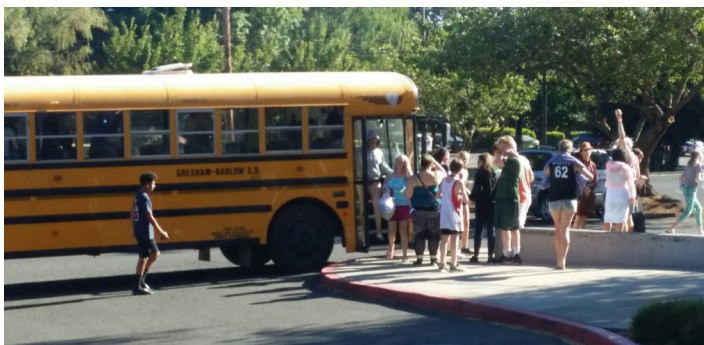
Above: Youth Return from Blue Lake; Below: Lunch