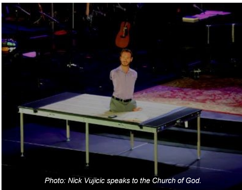
Photo: Nick Vujicic speaks to the Church of God.