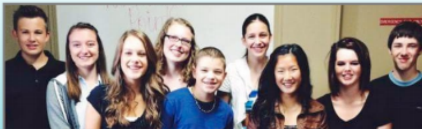
Turning Point Youth Worship Team

LIFE IMPACTING YOUTH SESSIONS WORSHIP—SPEAKING—SMALL GROUPS