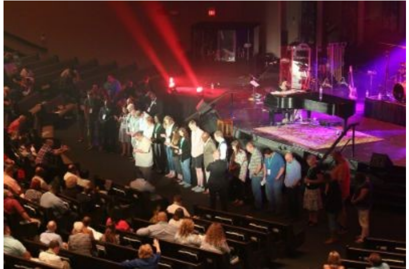
Photo: A part of the approx. 350 in the ordination process (Leadership Focus) at the memorial service, symbolizing a passing of the baton.