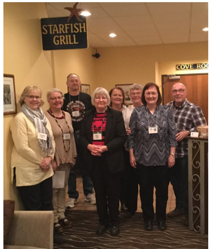
Friskies or 'Fraidies? Afternoon excursions lead to exploration of Mountaintops, Deserts and Fruitful Plains