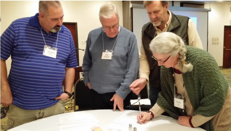
The conference gave ample opportunity for small group interaction and teamwork