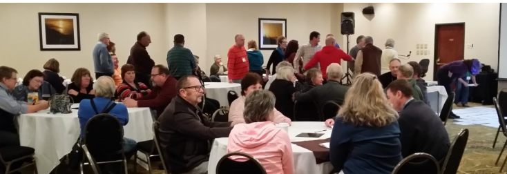
Above: Teams work on timelines and share findings