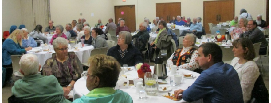
Above: Guests at the CWB fundraising dinner held at Mt. Scott Church of God October 13, 2017.