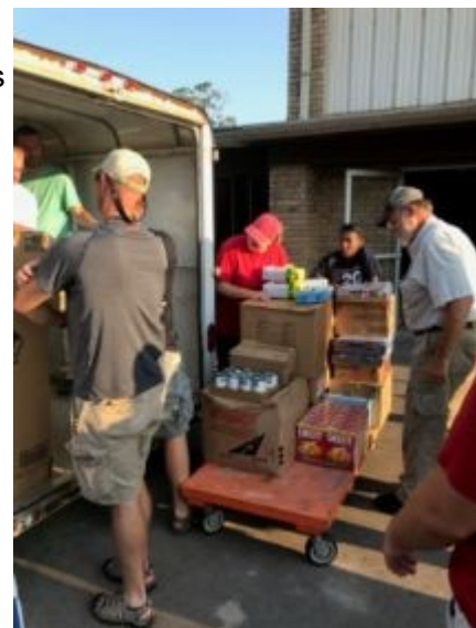
Fairview's Hurricane Harvey relief

Instead of continuing to grow themselves, the church planted two churches, one of which now sees 400 in