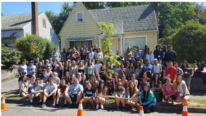
WPC Students planted the Class Tree August 21.