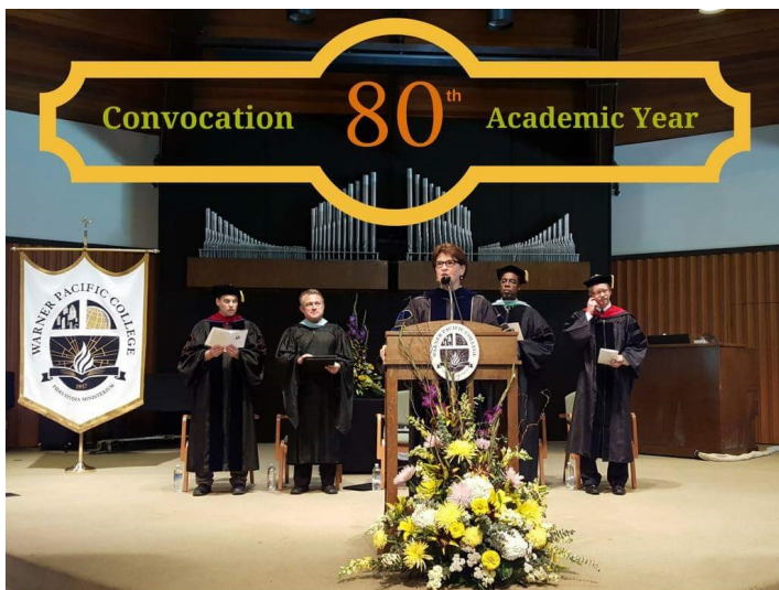
WPC Officially Began 80th Academic Year Aug. 23