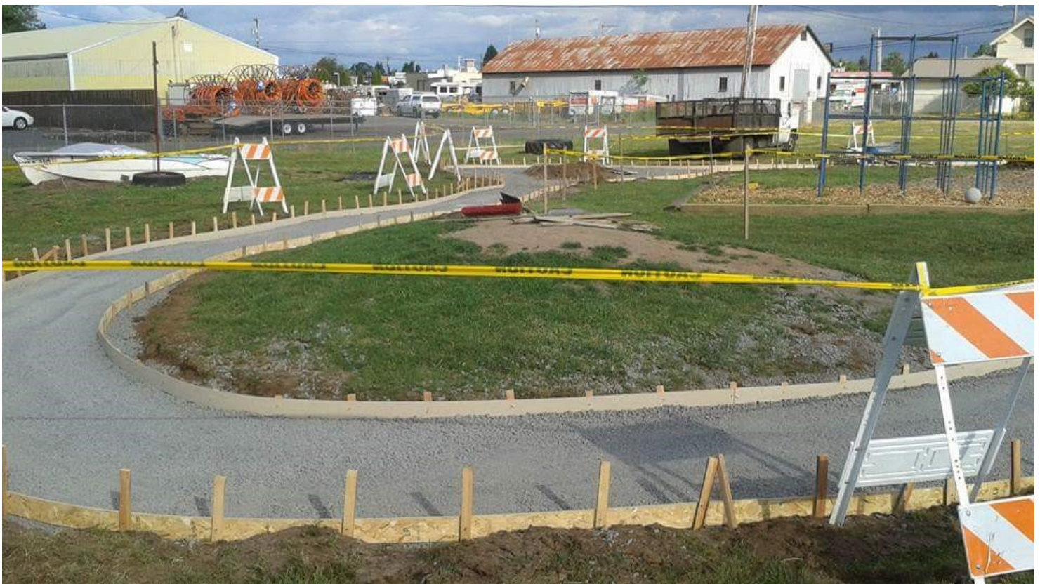
A long-time dream is being realized as construction began May 23rd on a new bike path addition to the playground at Sunset Park's Snoopeeland Child Development Center in St. Helens, Oregon.

Warner Pacific's lawn: 2219 SE 68 th Ave., Portland.