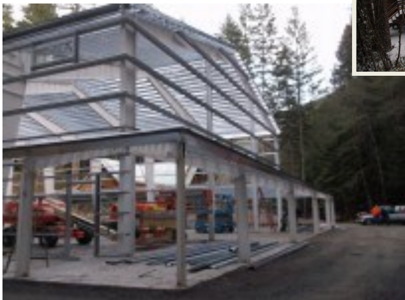
Camp White Branch Multipurpose Building