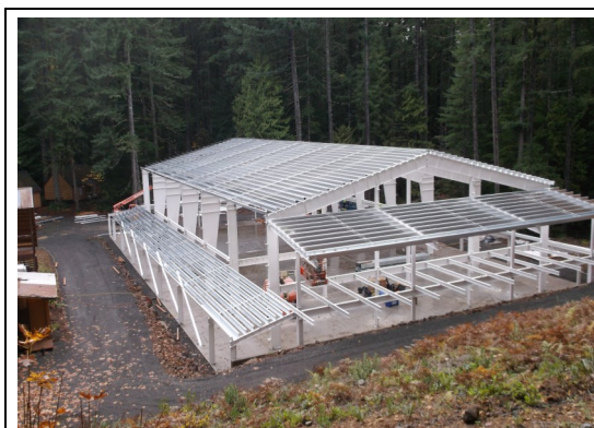
Camp White Branch Multipurpose Building: Structure is Up! See page 9 for CWB Update.

Good reports of practical materials are reflected in Hillsboro's related article (see page 2). -kt