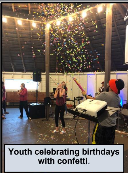
Youth celebrating birthdays with confetti.