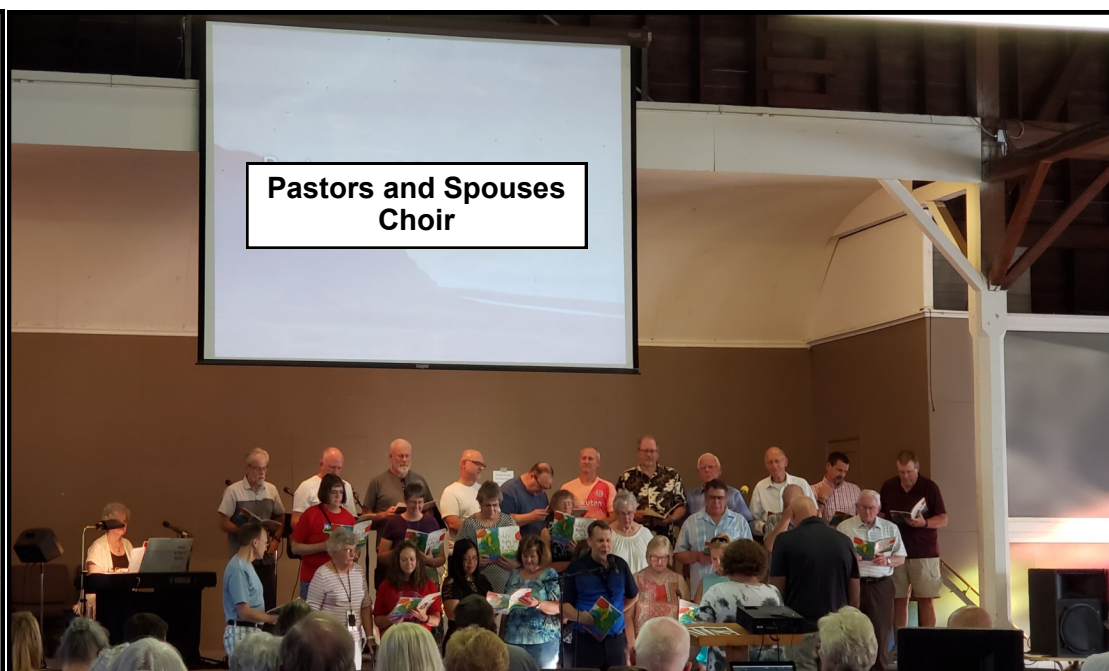
Pastors and Spouses Choir