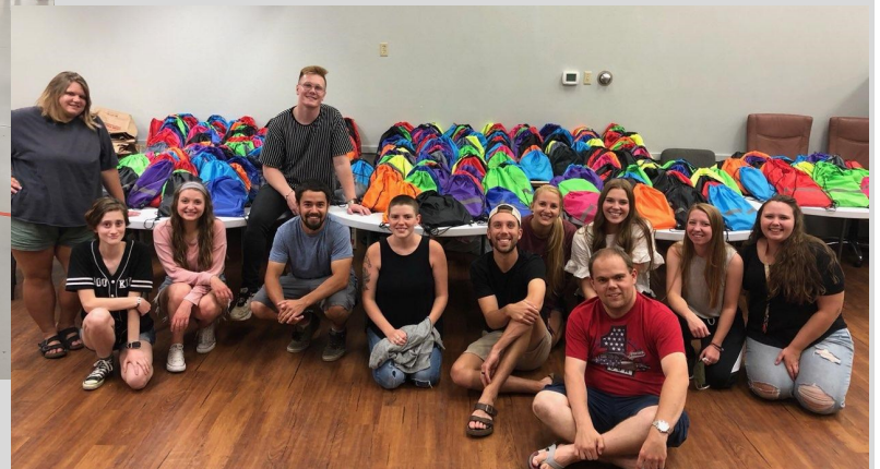
Vancouver Church Young Adults with Sacajawea Elementary backpacks