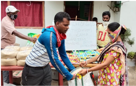
Passing out food in Siliguri, India