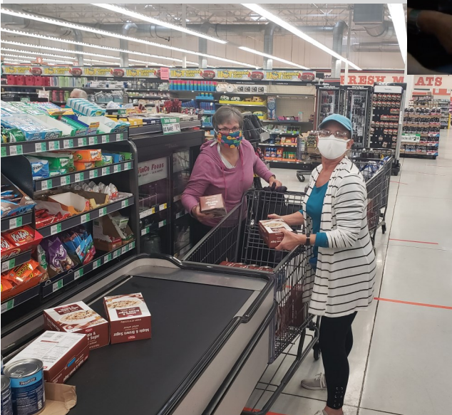
Vancouver Church community food box shoppers