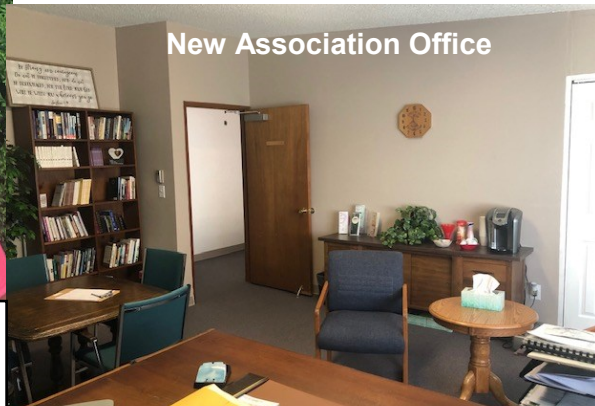
New Association Office