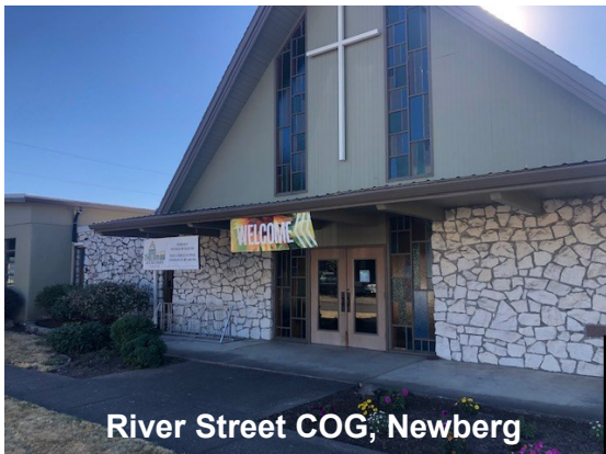
River Street COG, Newberg