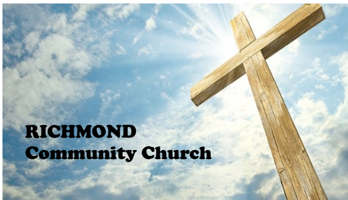
RICHMOND Community Church

Like many congregations, we have had several individuals and families that have been suffering economically. However, an anonymous benefactor has contacted our Board of Elders offering to financially help those needing assistance. God works in mysterious, but wonderful, ways.