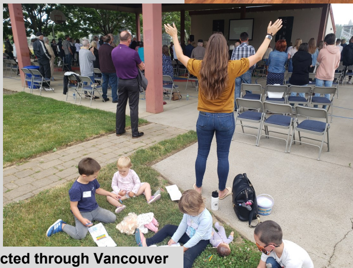
Staying connected through Vancouver Church outdoor gatherings