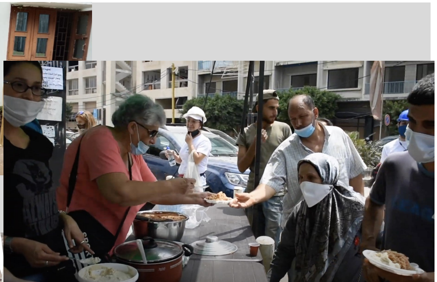
Aid workers from Heart for Lebanon in Beirut