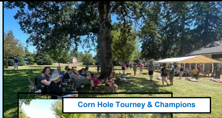
Corn Hole Tourney & Champions