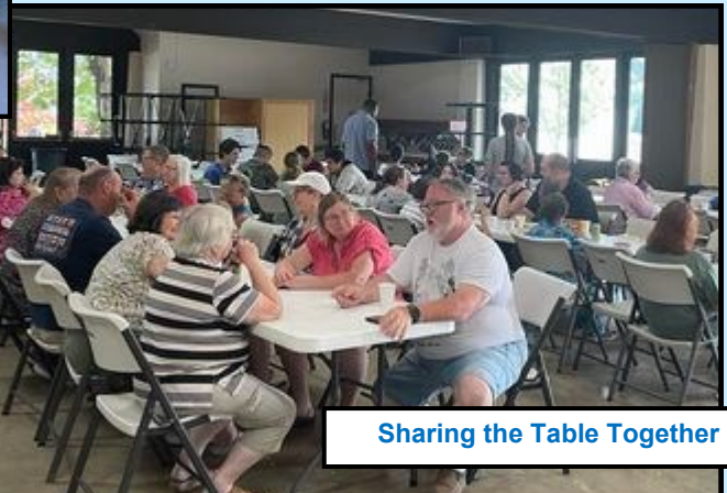
Sharing the Table Together