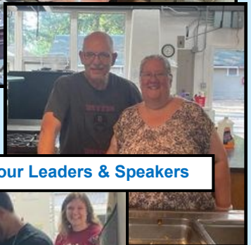
Some of our Leaders & Speakers