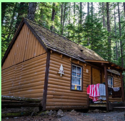
Cabin BEFORE Roofing & Remodel

In May, McKenzie Roofing reroofed the dining hall, Fir cabin, and the caretaker house (pictures below). This was much needed and will ensure longevity of the buildings. We had received funds from a Memorial Donation that enabled us to do this. This summer we received a grant from the State of Oregon and part of this will be used to reroof the remaining 5 cabins, the staff house, the pool house, and the office. Work will begin this next Spring.