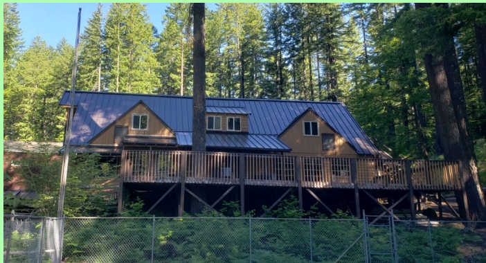
Dining Hall after Roofing