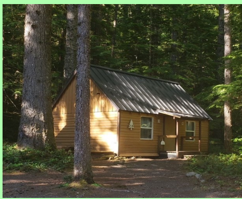
Cabin AFTER Roofing & Remodel with New Windows