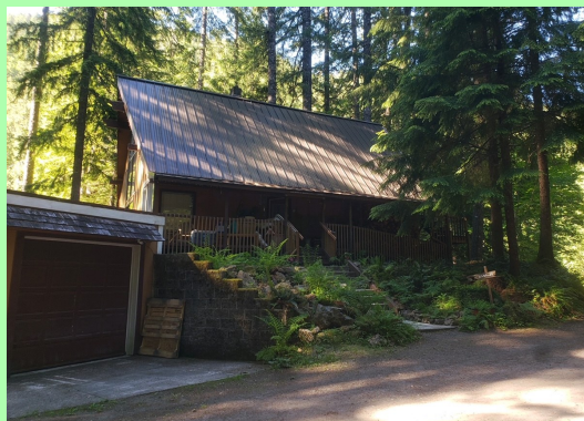
Manager House after Roofing