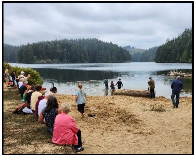
Baptisms at the lake!