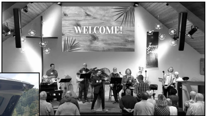
Reedsport hearty welcome!