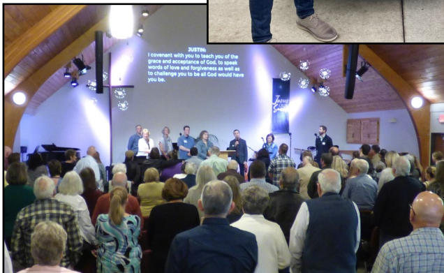
Installation Service Covenant