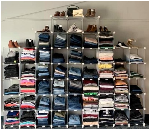
Clothing ready to bless teen girls in style!