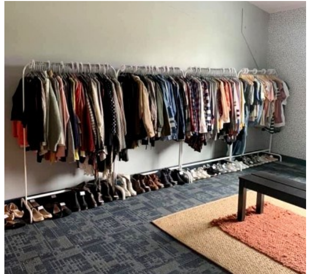
A variety of styles and sizes available!