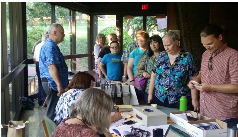
Staff and volunteers tend to registration in McGuire lobby.