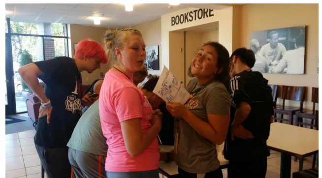
Teens grouped up to compete in an afternoon Scavenger Hunt.