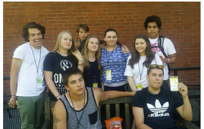
Tigard youth take a break to pose, while trying to agree on a fast-food destination.