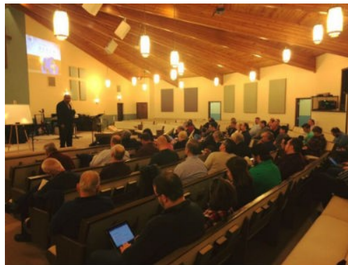
Boot Camp experience in Missouri