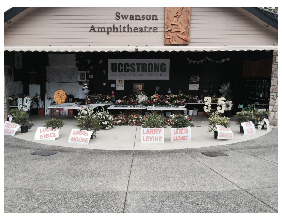
Memorial at Umpqua Community College, Roseburg, Oregon

I did not suffer from the illusion that we were. Before ever moving to Roseburg I did some demographic study of the place to which we were called. Douglas County is in fact a dark place. Economic indicators, employment, education levels and health indicators rank near the bottom of all of Oregon. Pastors everywhere have occasion to interact with and become aware of the darker side of the places they live, and I am no exception. I have seen first hand the destruction of drugs and alcohol abuse, as well as violent and abusive behavior. I have encountered significant numbers of persons suffering from mental health issues outside of any circle of care. And, all of this before the events of 10/1. To say Roseburg and Douglas County were an idyllic area before the UCC shooting would have been naive and borderline delusional. Yet this is the reality many long-term residents have been forced to grapple with for the