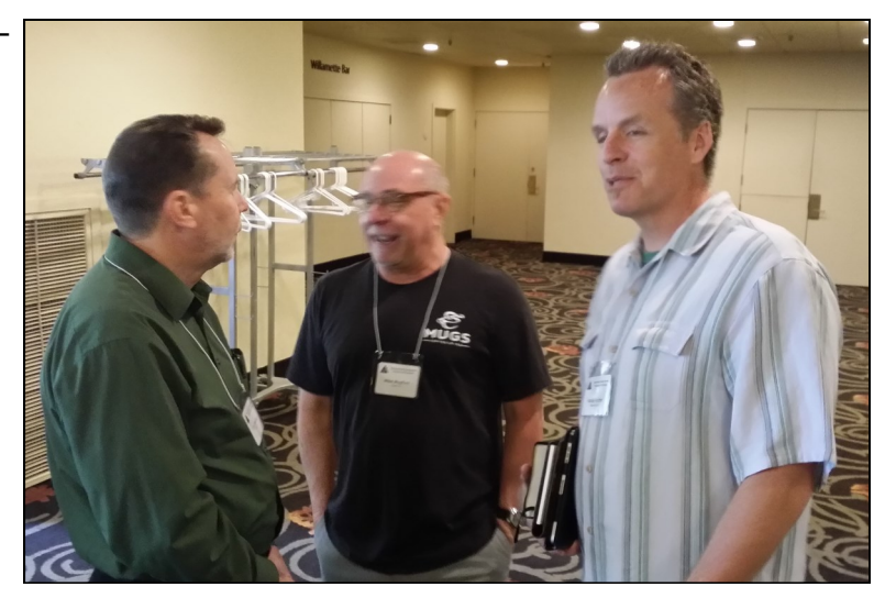
(Continued on page 2)