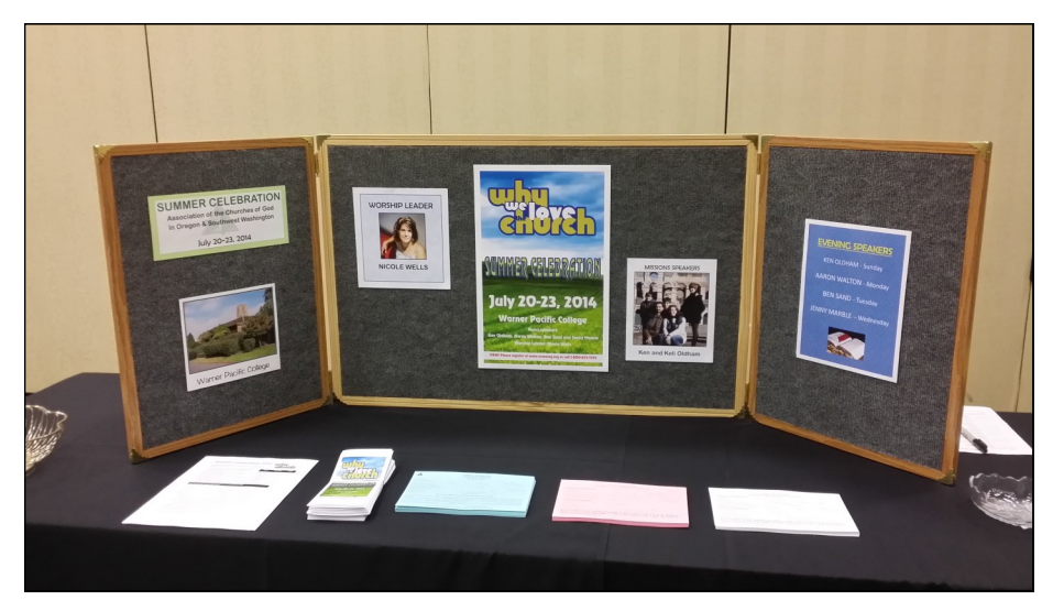
Above: Summer Celebration display—July 20-23, 2014 @WPC (Note: Youth attend an extended event, July 20-24)

The next Annual Business Meeting is scheduled for July 29, 2015 during Summer Celebration.